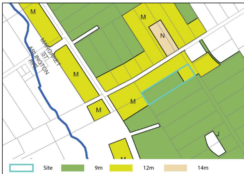
Figure 5: Draft Riverstone East Height of Building Map (under the SEPP)