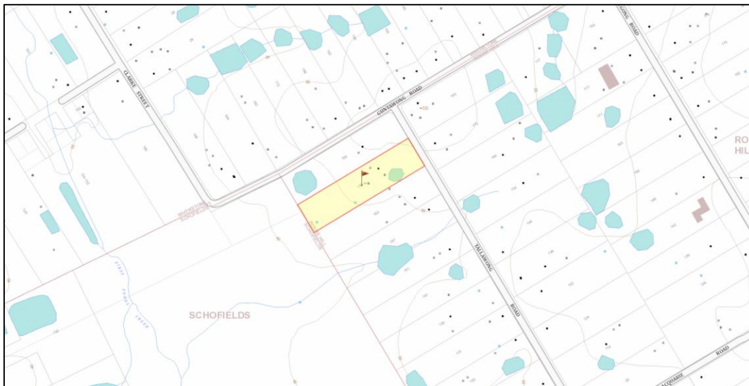
Figure 1: Site Map

The site is rectangular in shape and has a site area of approximately 2 hectares. The site has a frontage to Tallawong Road of approximately 72 metres and a depth of approximately 285 metres. The site has a general east to west orientation (Figure 1).