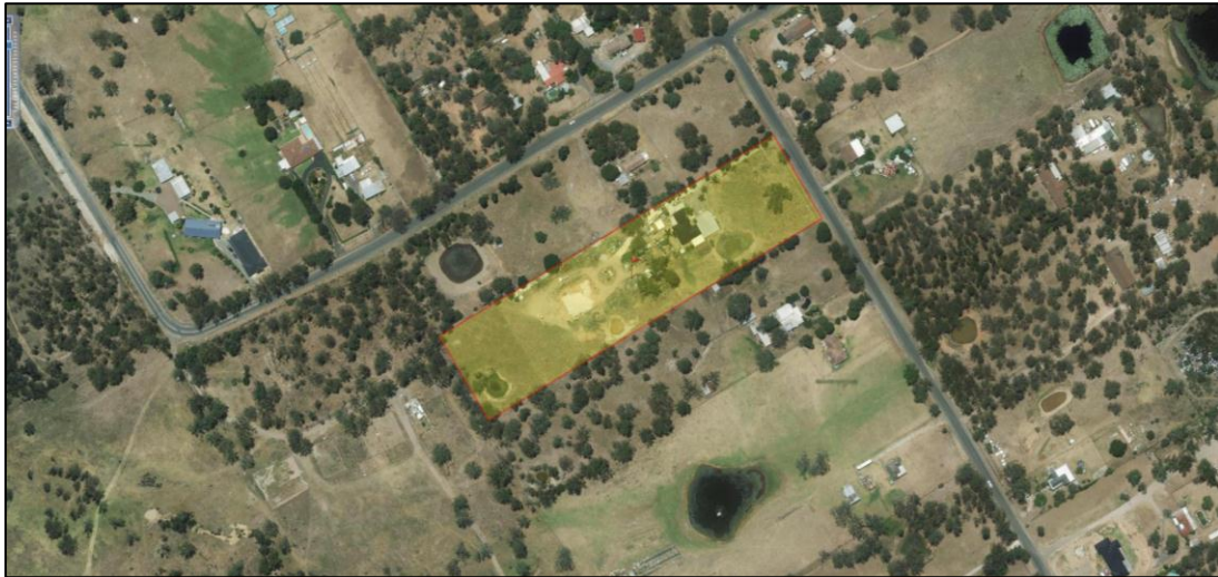
Figure 2: Aerial Map