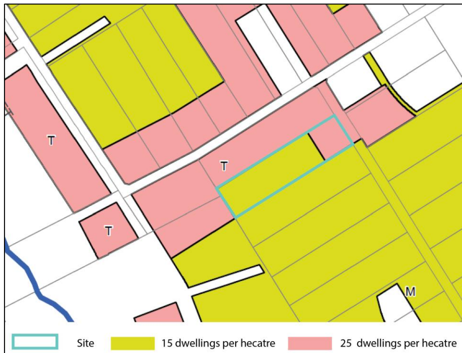
Figure 6: Draft Riverstone East Residential Density Map (under the SEPP)