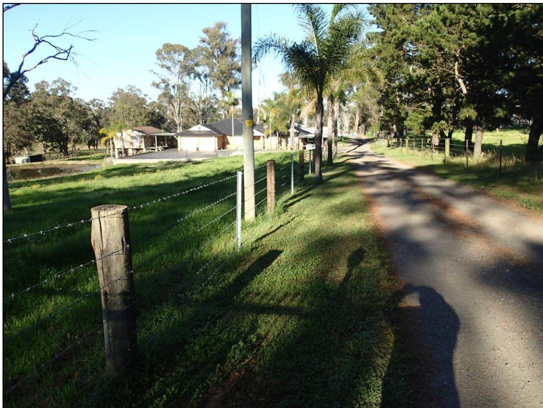
Photograph 1: Subject property from northern side boundary driveway off Tallawong Road