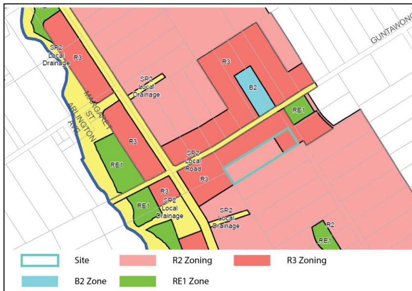
Figure 4: Draft Riverstone East Land Zoning Map (under the SEPP)

The Draft Plan indicates the subject site will be zoned R3 Medium Density Residential at the eastern portion facing Tallawong Road, and R2 Low Density Residential for the remaining portion. Draft development controls reflect these zonings in that the maximum building height for the R3 portion would be 12 metres with an expected residential density of 25 dwellings per hectare; whereas the R2 portion would have a maximum building height of only 9 metres and an expected residential density of 15 dwellings per hectare.