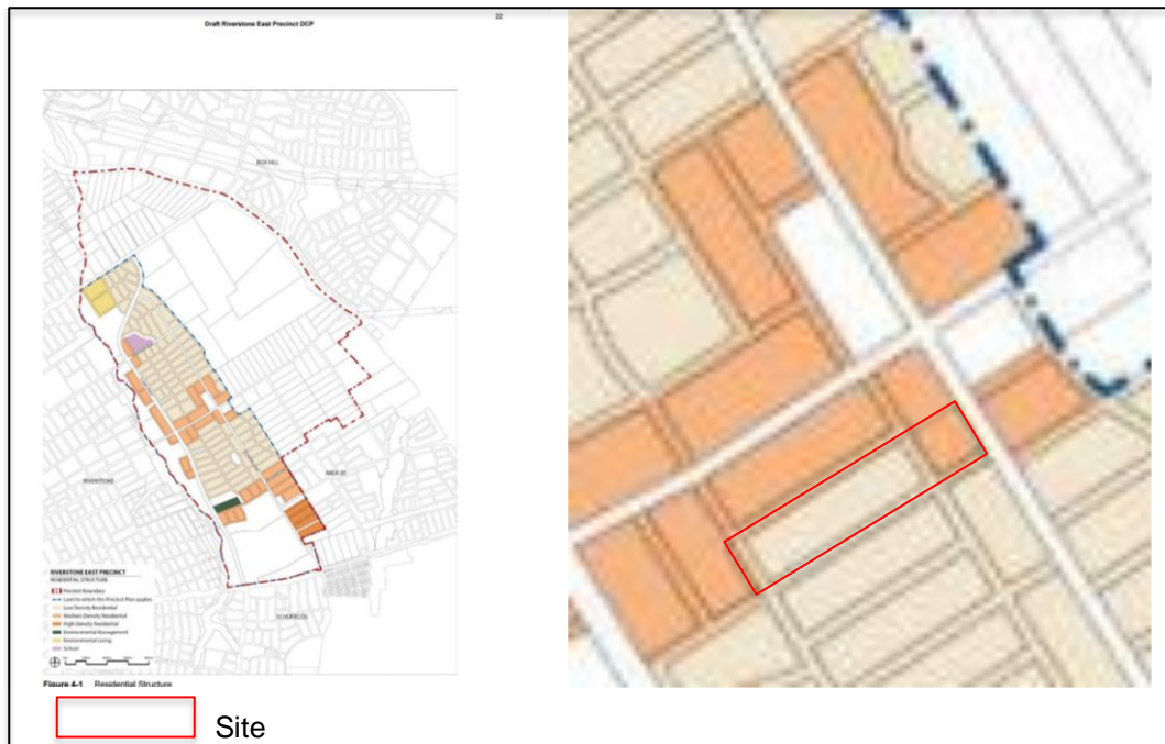
Figure 7: Residential Structure Plan (under the Draft DCP)

development with the neighbouring land in the eastern portion, which will face Tallawong Road with a rear lane behind; as well as a complete street block of low density housing, with a local road running along the entire southern boundary and across the rear western boundary.